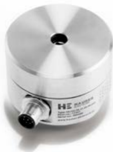
Series HE2XX with M12 connector