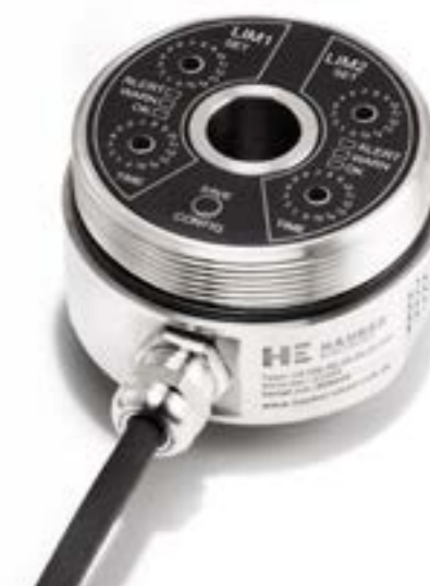
Series HE2XX (opened) with cable