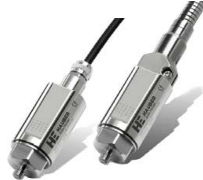
Series HE10X with integrated cable and flexible metal tubing (optional)