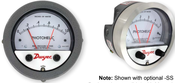
Note: Shown with optional -SS bezel. Backward compatible* with Magnehelic® gage.

Combines Differential Pressure Gage with Low/High Set-Points, Compact Size